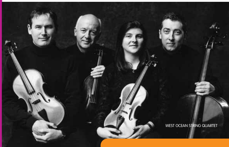
WEST OCEAN STRING QUARTET

Téada are one of the busiest young traditional bands on the scene today and their innovative approach to presenting traditional and newly composed tunes has won them widespread acclaim at festivals throughout Europe and the US. The Irish Times has applauded Téada for ‘keeping the traditional flag flying at full mast’ .