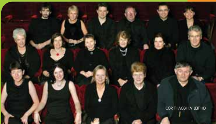
CÓR THAOBH A' LEITHID